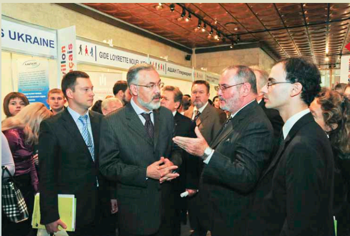
Minister for Education and Science, Youth and Sport of Ukraine and Ambassador Extraordinary and Plenipotentiary of France to Ukraine during the review of the fair in November, 2010