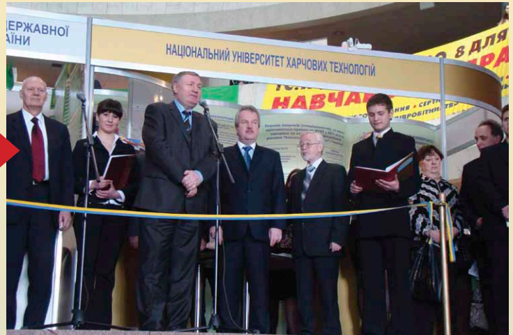
Inauguration of the fair on April, 7-9, 2011