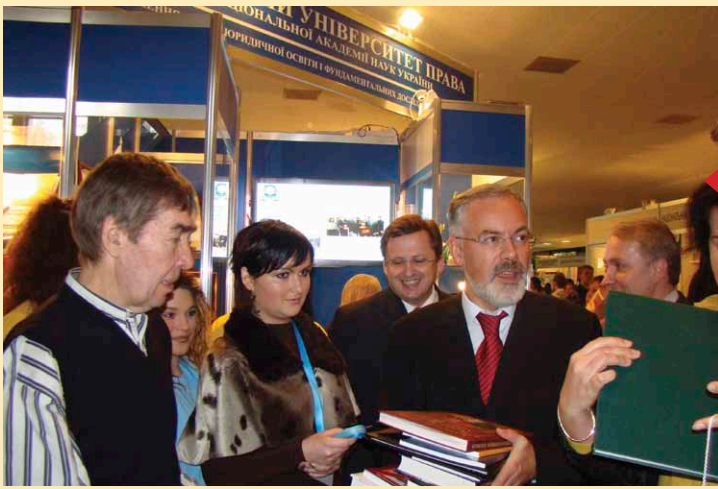
Minister for Education and Science, Youth and Sport of Ukraine Dmytro Tabachnik is during socializing with the participants of fairs «Education and career – 2011» and «Education abroad»